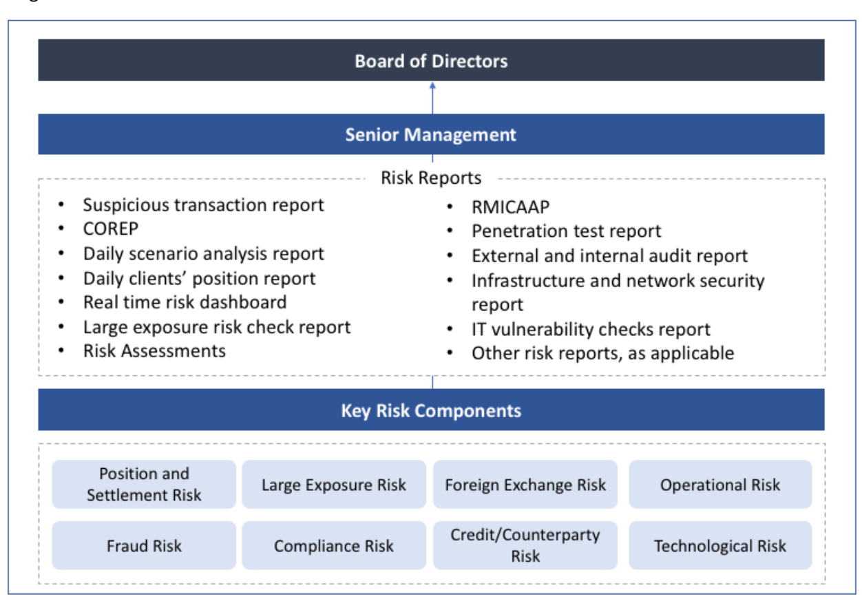
Diagram 2. Risk information flow to the Board of Directors

The following describes the risk reporting flow of the Company: